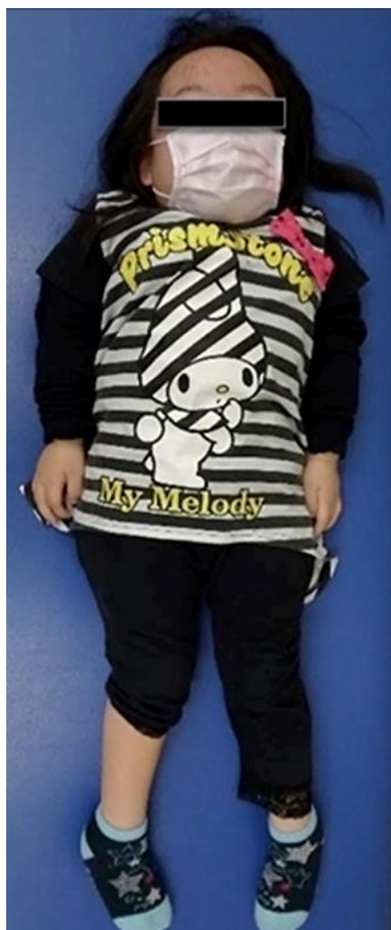
Fig. 1. General appearance of a 13-year-old Japanese girl with spondyloepiphyseal dysplasia congenita. She exhibited short trunk and limbs.