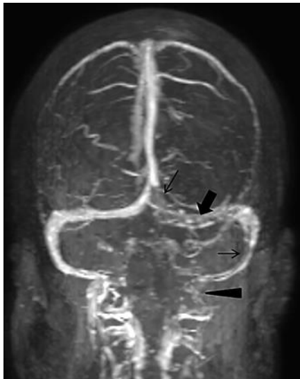
Fig. 4. A postcontrast MR venogram of the head showed nonocclusive venous thrombosis of the torcula (vertical thin arrow), left transverse sinus (thick arrow), and sigmoid sinus (horizontal thin arrow), extending to occlude the proximal part of the left internal jugular vein (arrowhead).