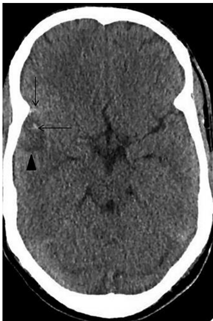
Fig. 1. A CT scan of the head showed a small hypodense lesion in the right temporal lobe anteriorly (arrow-head) with mild surrounding edema and mass effect. Tiny foci of hyperdense hemorrhage were seen within the lesion (horizontal arrow) and in the adjacent Sylvian fissure (vertical arrow).