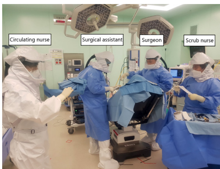
Fig. 1. Patient positioning and preparation in the negative-pressure operating room.