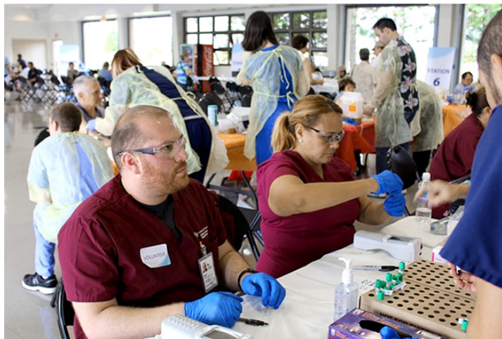
Fig. 1. Photos from National Kidney Foundation of Hawaii Kidney Early Detection Screening Program events.

rationale for the program, obtained informed consent, and provided a description of the following 5 stations screening participants would rotate through (Fig. 1):