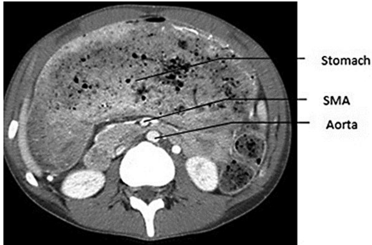
Fig. 2. CT scan showing the SMA and the aorta separated by a small distance of 5.5 mm and severe gastric distension.